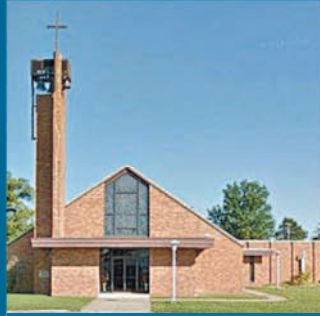
St. Ignatius of Antioch (Bobtown)