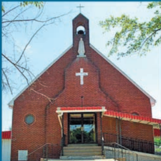
St. Mary's (Crucible)