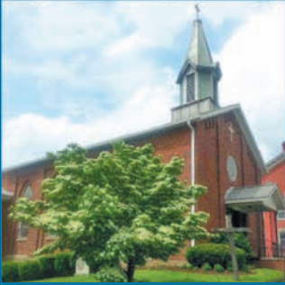
St. Ann (Waynesburg)