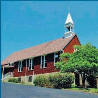
Our Lady of Consolation (Nemacolin)