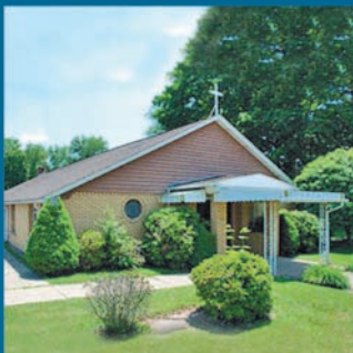
Sacred Heart (Rices Landing)