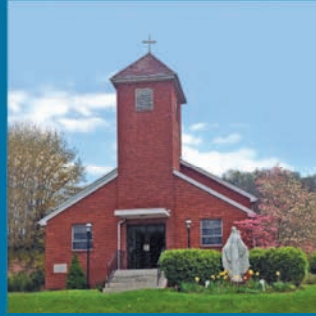
St. Thomas (Clarksville)