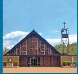
St. Marcellus (Jefferson)