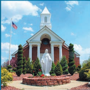
St. Hugh (Carmichaels)