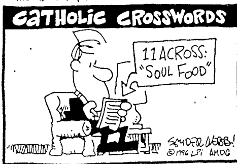
THE BODY & BLOOD OF CHRIST