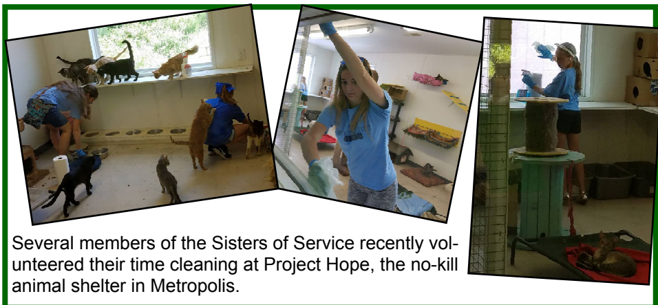
Several members of the Sisters of Service recently volunteered their time cleaning at Project Hope, the no-kill animal shelter in Metropolis.