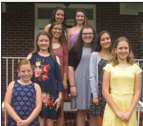
Sisters of Service members met recently to install new officers for the coming year.