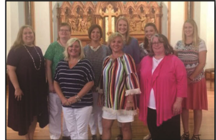
St. Mary teachers recently attended the "Celebration of Catholic Schools Mass" in Henderson, KY at Holy Name Church. All the faculty of Catholic Schools in the Dioceses attended and prayed together for our students and the upcoming school year.