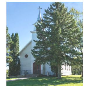
St. John Cantius Parish 306 2nd St. Fairchild WI 54741-8514 715-334-2202