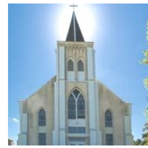
Immaculate Conception Parish 341 W Main St PO Box 188 Alma Center WI 54611-0188 715-964-5201