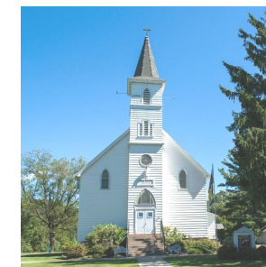
St. Joseph Parish-Fairview N13740 Fairview Rd Fairchild WI 54741-8514 715-334-2202