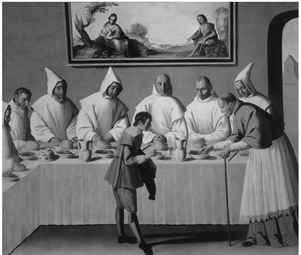
Saint Hugh in the refectory San Hugo en el refectorio 17th century oil painting on canvas by Francisco de Zurbarán Seville Museum of Fine Arts