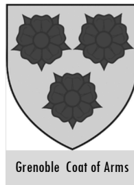
Grenoble Coat of Arms

In 1084, Hugh helped Saint Bruno of Cologne and six of his companions found the great Carthusian monastery "La Grande Chartreuse" high in the Alps. They devoted their monastic life to prayer and study and were visited by Hugh often. It was reported that, as much as he could in his role as bishop, Hugh adopted the monastic way of life practiced by the monks at Chartreuse. The 2005 film, Into Great Silence , documented the daily life at La Grande Chartreuse. After many years of illness which he endured in patient silence, Saint Hugh died on April 1, 1132 and was canonized only two years later by Pope Innocent II.