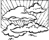
Why do you stand looking at the sky?