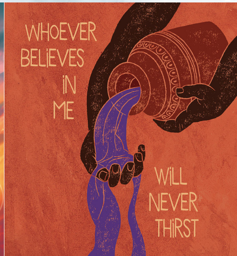
The Little Ones