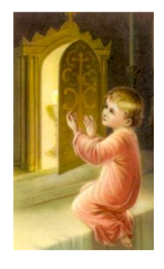
Blood of Christ, Eucharistic drink and refreshment of souls, save us.

MONDAY, JULY 21st through THURSDAY, JULY 24th: 6:00-8:00 PM...All welcome to attend the Carnival (6:00) and Mass (7:15) on Thursday, 24th in the Cemetery!