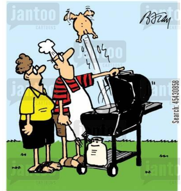
"I TOLD YOU THAT CHICKEN WASN'T COOKED!"

CONFIRMATION: Confirmation Mass has been scheduled for Oct. 4th at 2pm at St. John's Church. We will have 22 people getting confirmed from our parishes. 12 from St. John's; 3 from St. Mary's; 7 from St. Peter's.