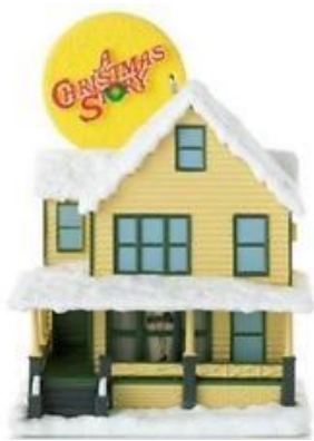
The House on Cleveland St.