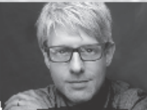
MATT MAHER Live in Concert FRIDAY NIGHT @ 7:00 P.M.