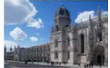
Monasterio de los Jeronimos