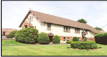
Saint Margaret Church 431 Lincoln Ave.—Saugus, MA 01906 Office Location: 14 Summer St. 781-233-1040 Business Hours: 9:00 a.m.-4:00 p.m. Other times by appointment only