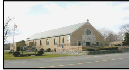
Blessed Sacrament Church 14 Summer St.—Saugus, MA 01906 Office Location: 14 Summer St. 781-233-2497 Business Hours: 9:00 a.m.-4:00 p.m. Other times by appointment only