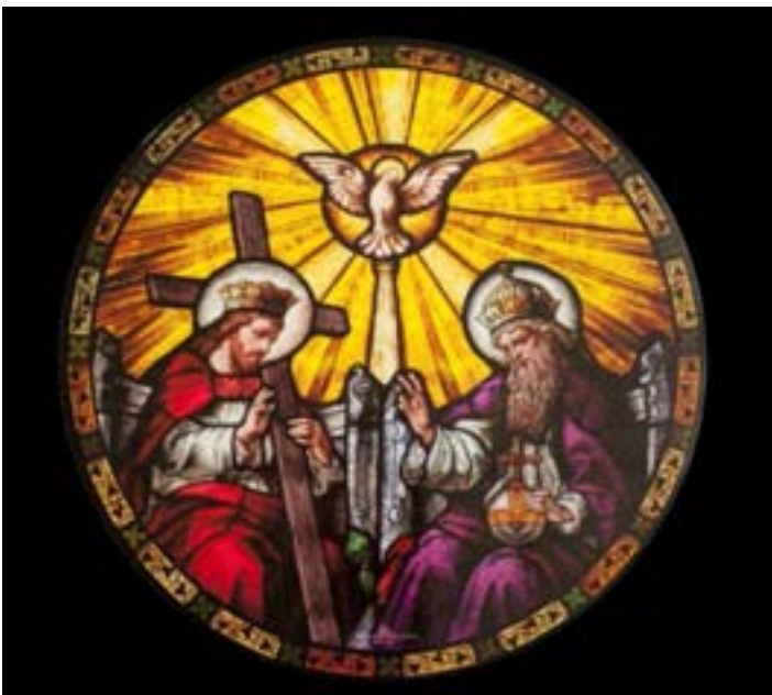
The Holy Trinity