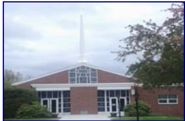
St. James Church West Groton