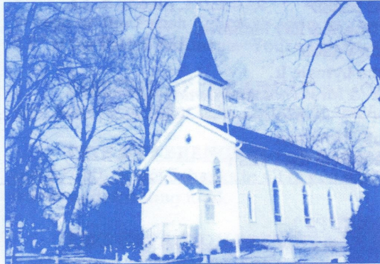
Saint Patrick Church