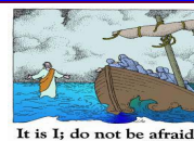
It is I; do not be afraid.

As Jesus walked on the sea, the disciples were terrified (Matthew 14:22-33)